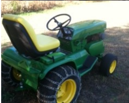
Refurbished 1969 John Deere garden tractor

One of our more ambitious late summer and fall projects was the construction of the highland chamber and propagation shed. This project involved running water, electricity, and heater lines over 150 feet, disassembly and reassembly of the shed, and construction of the highland chamber and propagation benches. A side benefit of the project was providing water and electricity at the potting area.