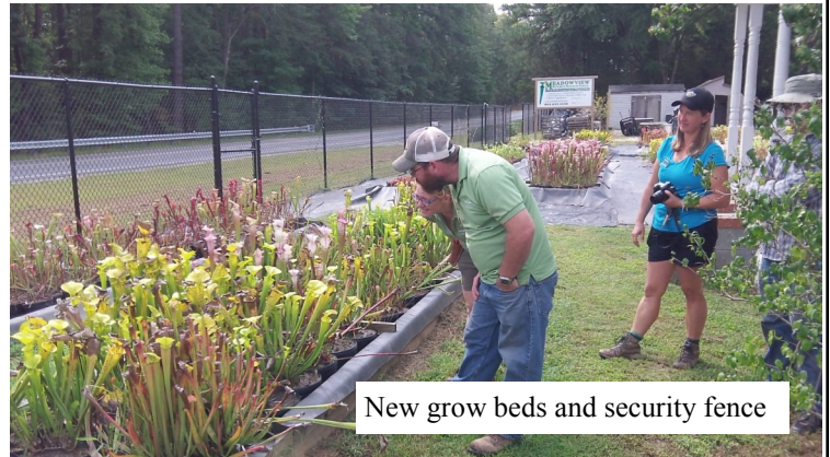
New grow beds and security fence