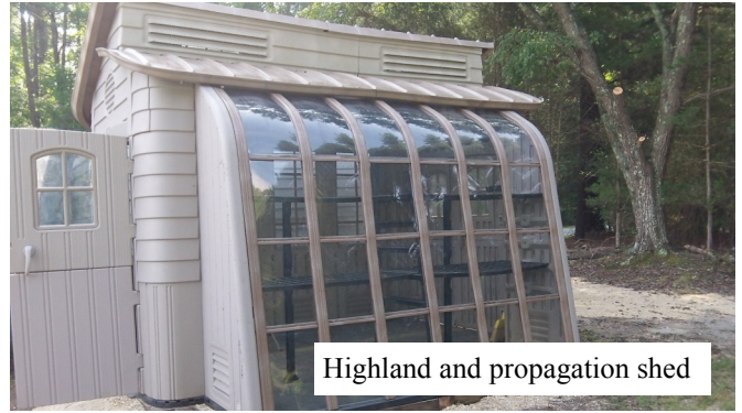
Highland and propagation shed

2014 was an amazing year for infrastructure upgrades at Meadowview. Thanks to some generous donations from one of our board members we are able to hire D&W Fence Inc. to install the security fence and gates at Meadowview, complete the solar shed encapsulating and protecting the wood furnace, add two more solar hot water collectors on solar shed, and put a new metal roof over the kitchen and sunroom. The solar shed is also providing additional storage for equipment and tools.