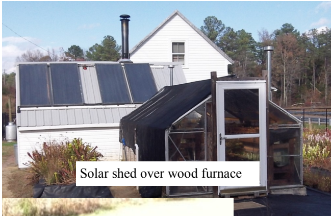
Solar shed over wood furnace