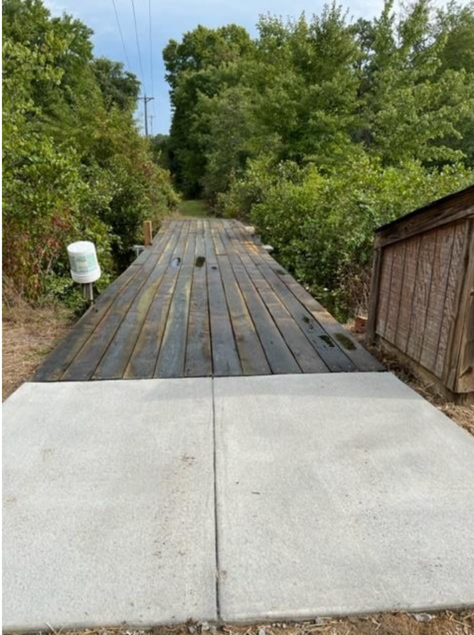
Figure 5. Bridge we built over Meadow Creek to get to Meadow Hill (Moon) house and land we bought in 2021.