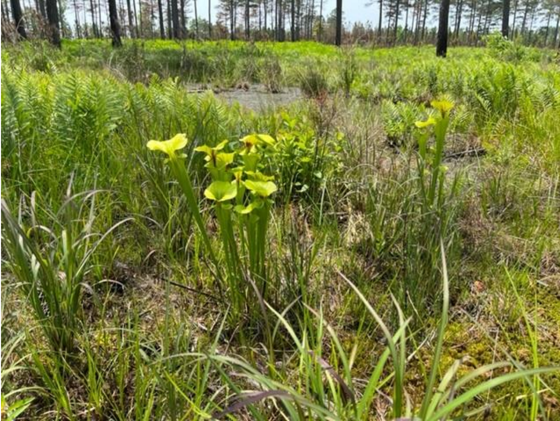
Figure 3. Yellow pitcher plant in restored wetland pine savanna at Joseph Pines Preserve.