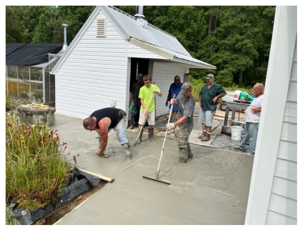
Figure 6. Pouring concrete patio and walkway at Meadowview to improve aesthetics, reduce maintenance, and increase safety.