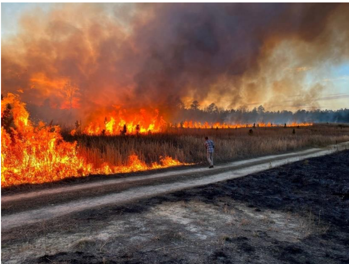
Figure 1. March prescribed burn at Joseph Pines.