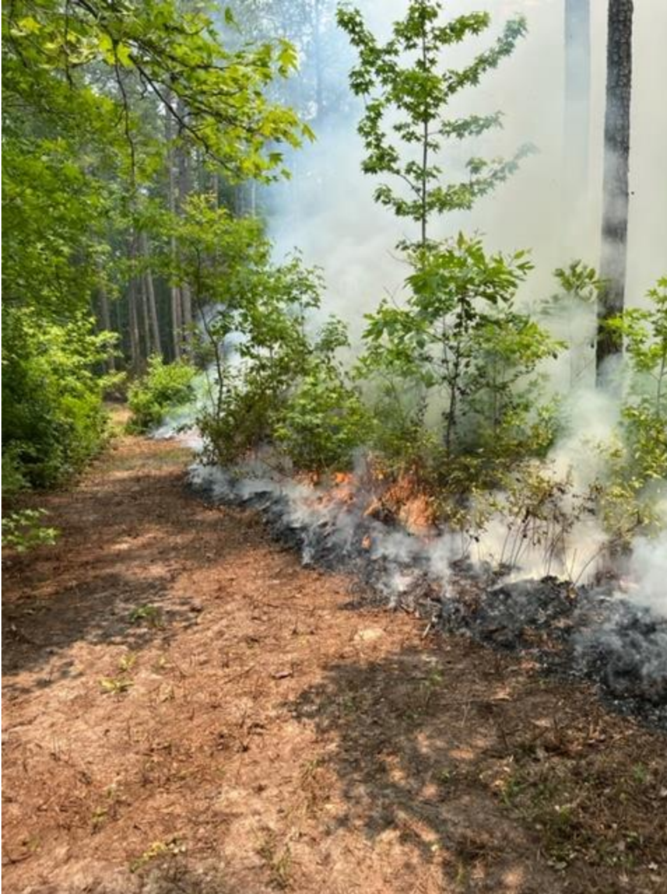
Figure 4. June prescribed burn at Central VA Preserve.