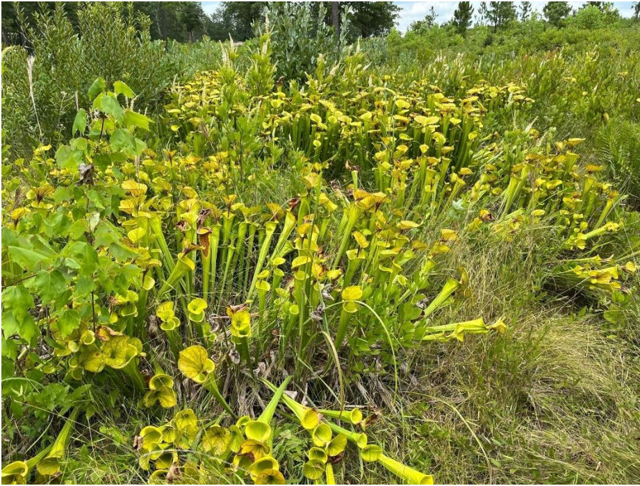
Figure 2. Yellow Pitcher plant at Joseph Pines after burn.