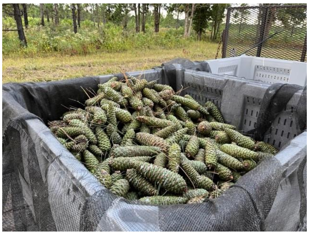
Figure 8. VA longleaf pine cones harvested at Joseph Pines. Our cones were 25% of the total cone seed crop produced in VA in 2023.