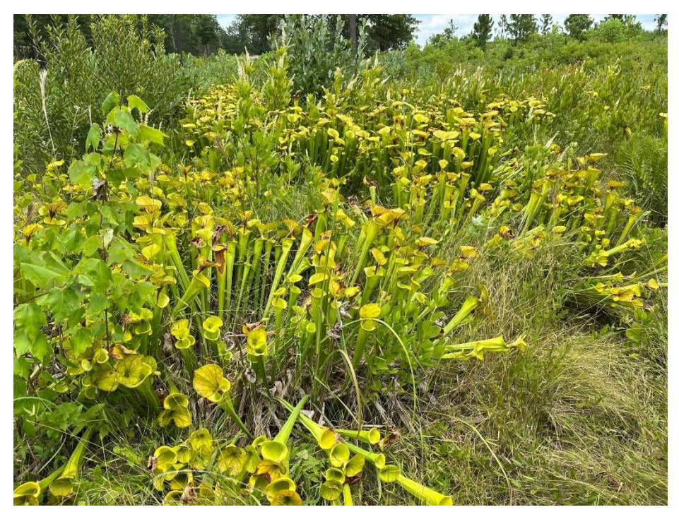
Figure 2. Yellow Pitcher plant at Joseph Pines after burn.