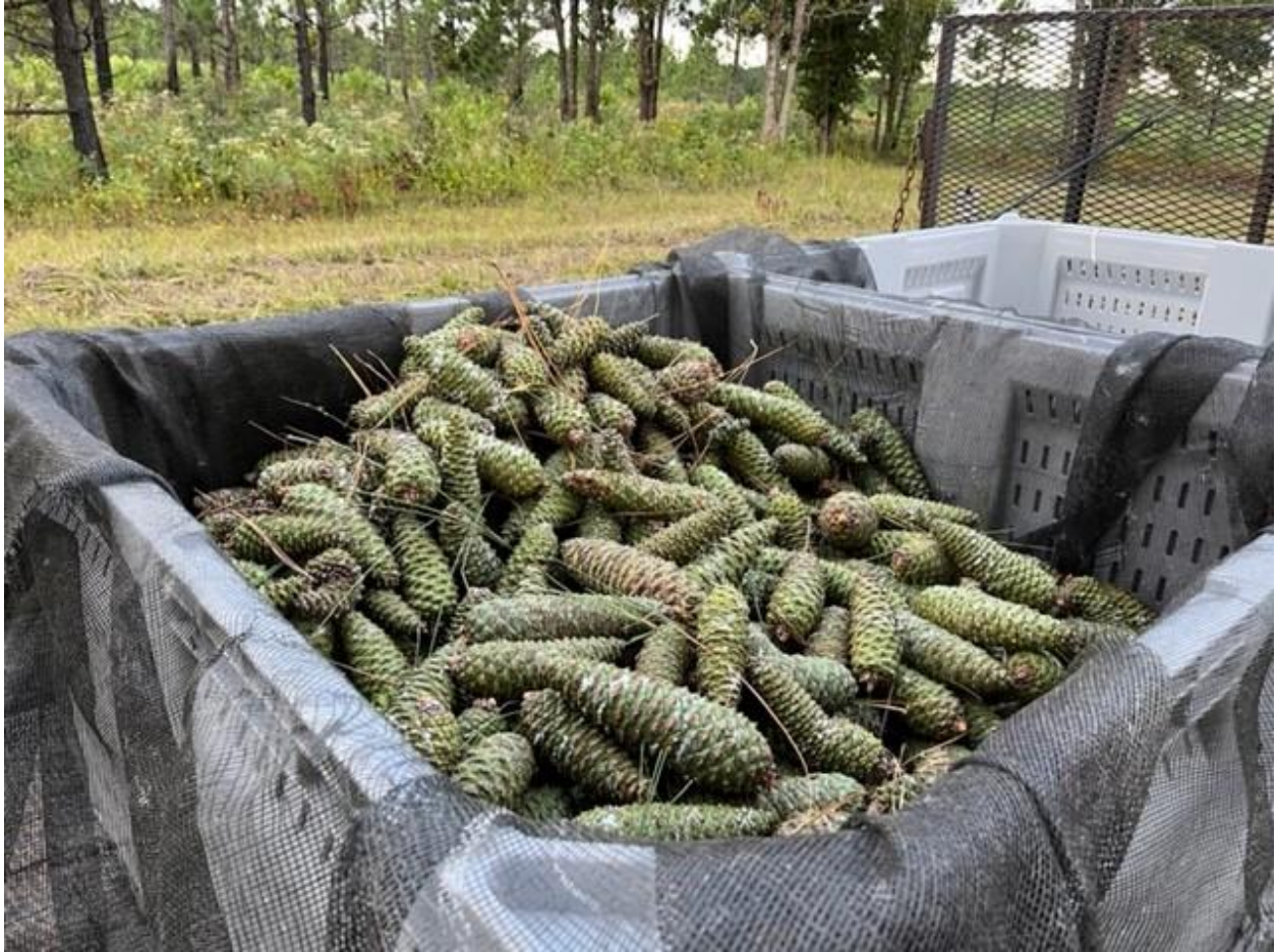
Figure 8. VA longleaf pine cones harvested at Joseph Pines. Our cones were 25% of the total cone seed crop produced in VA in 2023.