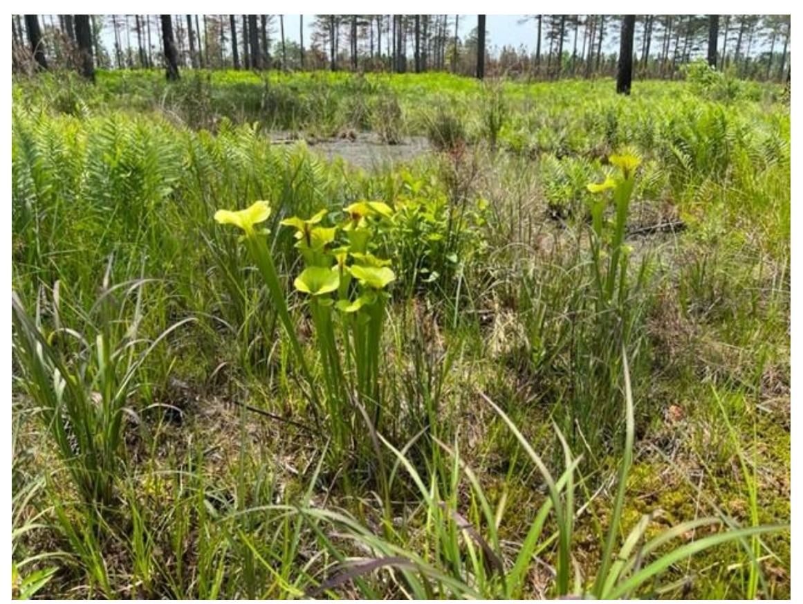
Figure 3. Yellow pitcher plant in restored wetland pine savanna at Joseph Pines Preserve.