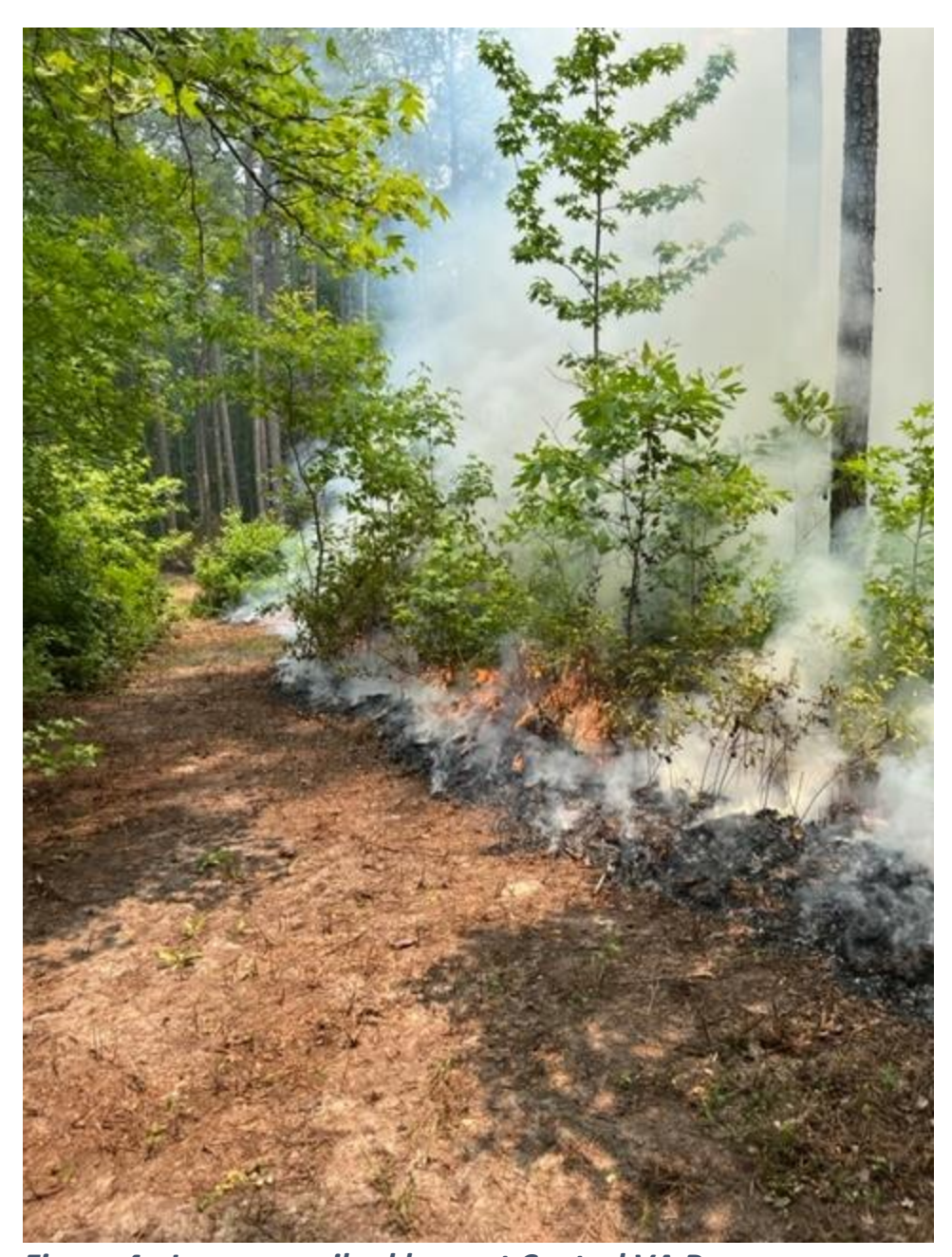
Figure 4. June prescribed burn at Central VA Preserve.