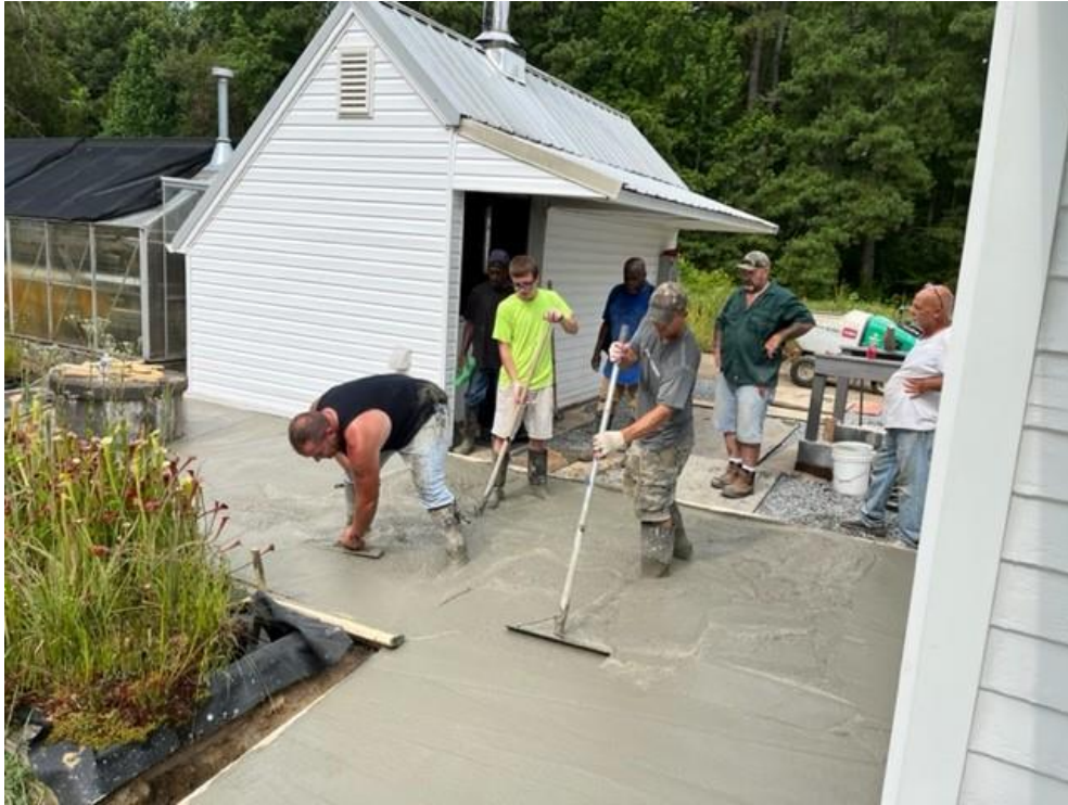
Figure 6. Pouring concrete patio and walkway at Meadowview to improve aesthetics, reduce maintenance, and increase safety.